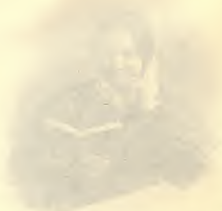
Lydia Maria Child